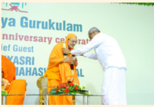
Honouring of Acarya